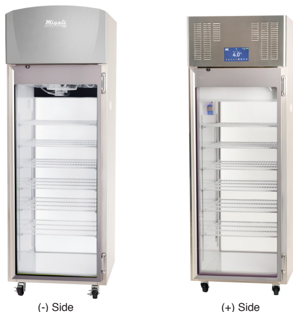
*Shown with optional IntelVU® Touch Screen Display

*Migali® IntelVU®: Touch Screen Microprocessor, 24/7 temperature monitoring, downloadable via USB port, full control over refrigerator performance with many additional features. See Migali® IntelVU® spec sheet.