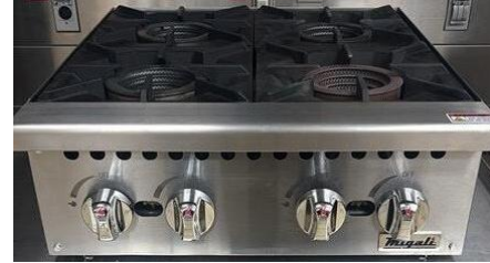
Figure 1 “Migali” C-HP-4B-24-NG-IB gas counter-top range

The “Migali” Model C-HP-4B-24-NG-IB, a counter range top (Figure 1), was evaluated for energy performance at the Southern California Gas Company’s (SCG) Commercial Food Service Testing Laboratory (FSTL). The counter range top was tested according to the specifications of The American Society for Testing and Materials’ (ASTM) standard test method F 1521-22. The test results for the Migali C-HP-4B-24-NG-IB (S/N 2404080009) are as follows: